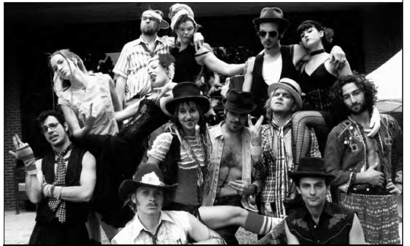
THE YARD DOGS ROAD SHOW PERFORMS WEDNESDAY AT SAM BOND'S GARAGE.

GOOD TIMES 375 E. 7TH AVE. • 484-7181 TU: Rooster's Blues Jam-8