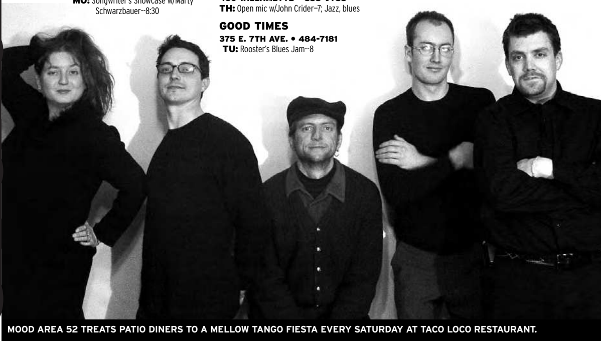
MOOD AREA 52 TREATS PATIO DINERS TO A MELLOW TANGO FIESTA EVERY SATURDAY AT TACO LOCO RESTAURANT.