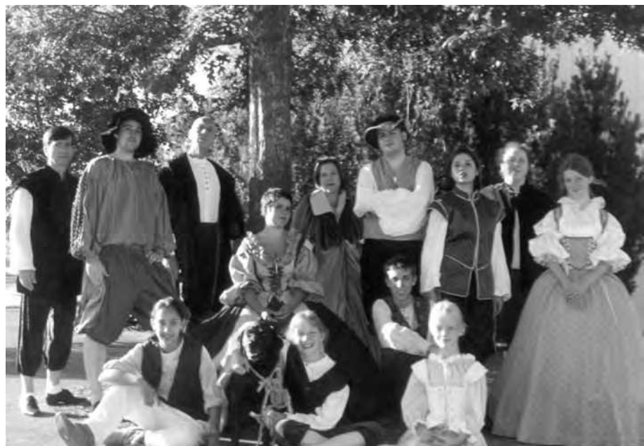
SHAKESPEARE IN THE PARK PRESENTS TWO GENTLEMEN OF VERONA, AMAZON PARK. SEE SATURDAY.

1219 SW PARK AVE. PORTLAND, OR 97205 503-226-2811 PORTLANDARTMUSEUM.ORG