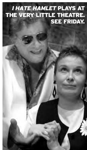
I HATE HAMLET PLAYS AT THE VERY LITTLE THEATRE. SEE FRIDAY.