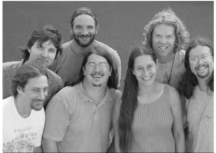
THE DARKSTAR ORCHESTRA PLAYS A COUNTRY FAIR CD RELEASE PARTY MONDAY AT THE MCDONALD THEATRE.

SAMURAI DUCK 980 OAK ST. • 345-6577 TH: Avoid the Future Shadow, YouEssAyEffYouKay, Blood Red Thread-9:30 FR: Gargantula-9:30 SA: The High Dials-9:30; Psychedelic TU: THIRD-9:30