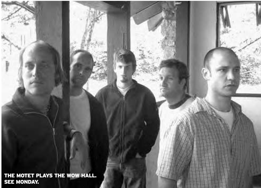
THE MOTET PLAYS THE WOW HALL. SEE MONDAY.

14 MONDAY Sunrise 5:43 am; Sunset 8:54 pm Av High 82; Av Low 51