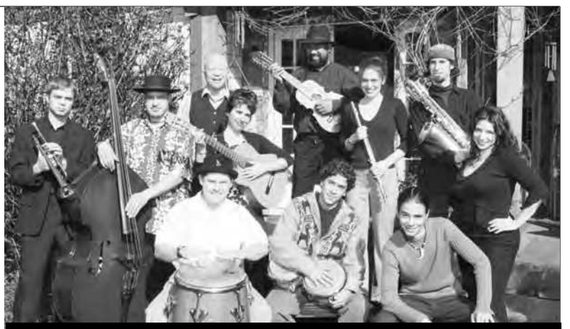
SON MELAO MAKES THE CROWD SWEAT FRIDAY AT LUNA.

CORNUCOPIA 295 W. 17TH ST. • 485-2300 TH: Fiddlin' Sue-6; Sue-grass FR: Red Pajamas-6; Folk SA: Fiddlin' Sue-6; Sue-grass