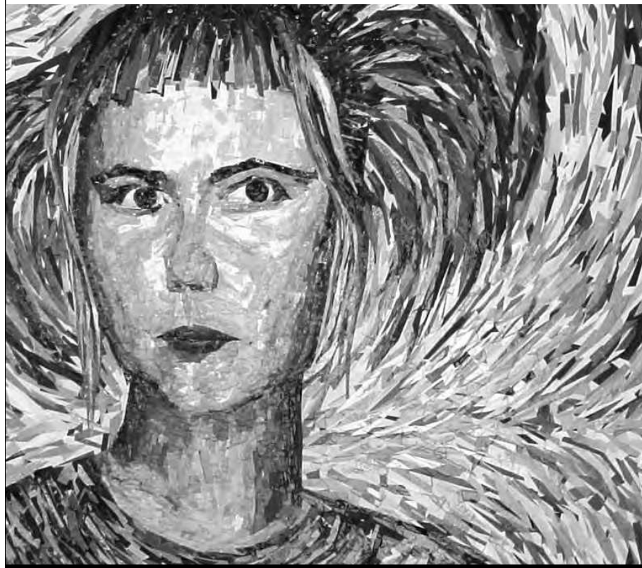
DETAIL OF SUMMER , BY SHAWN MEDIACLAST, PART OF VISIBLE NOISE , FEINSTEIN'S MUSEUM OF UNFINE ART, THROUGH JUNE 30.

Procedures are done in a pleasant local environment over a period of only six weeks, and donors are compensated $2500 for their time. If you are a healthy woman age 21-31 and are interested, call 683-1559 or visit our website at www.WomensCare.com .