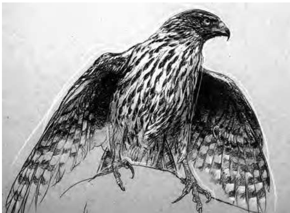
WORK BY DAN CHEN, IN A STUDIO SALE AND SHOW OF WORK BY DAN CHEN AND OTHERS. SEE SATURDAY CALENDAR.

KIDSTUFF "Discovering Bugs for Kids" for ages 5 to 10, 2 pm, Mt. Pisgah Arboretum. Ages 5-7 require parent attendance. $10 child, $5 parent.