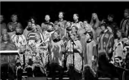
Soromundi, Lesbian Chorus of Eugene

ADMISSION: $5 ADV., $7.50 DAY OF FESTIVAL