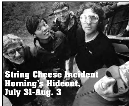
String Cheese Incident Horning's Hideout, July 31-Aug. 3