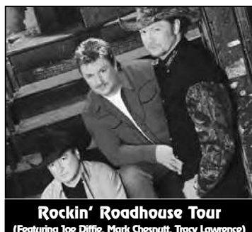
Rockin' Roadhouse Tour (Featuring Joe Diffie, Mark Chesnut, Tracy Lawrence)