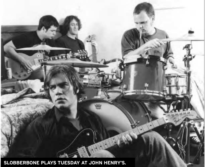
SLOBBERBONE PLAYS TUESDAY AT JOHN HENRY'S.