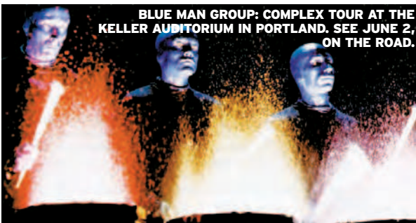
BLUE MAN GROUP: COMPLEX TOUR AT THE KELLER AUDITORIUM IN PORTLAND. SEE JUNE 2, ON THE ROAD.

MAY 31 Corvallis Saturday Market features local crafts, food, children's activities and entertainment, 9 am to 1 pm Saturdays through Nov. 22, South Riverfront parking lot, 1st and Jackson Streets. FREE.