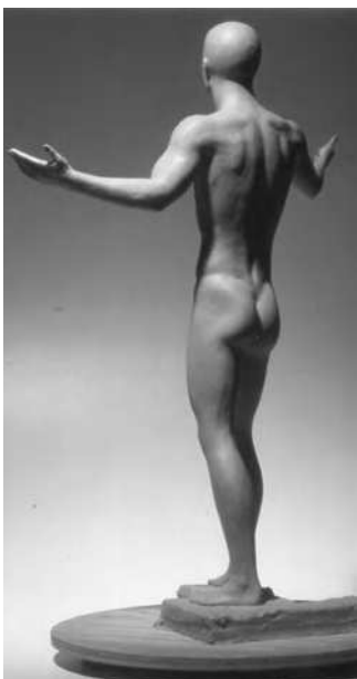
THE OFFERING, A SCULPTURE BY MIKE LECKIE, AT ELEMENTS GLASS IN OVERTON. SEE JUNE 5, ON THE ROAD.

Piccadilly flea market, 10 am, Lane Co. Fairgrounds. $1.50.