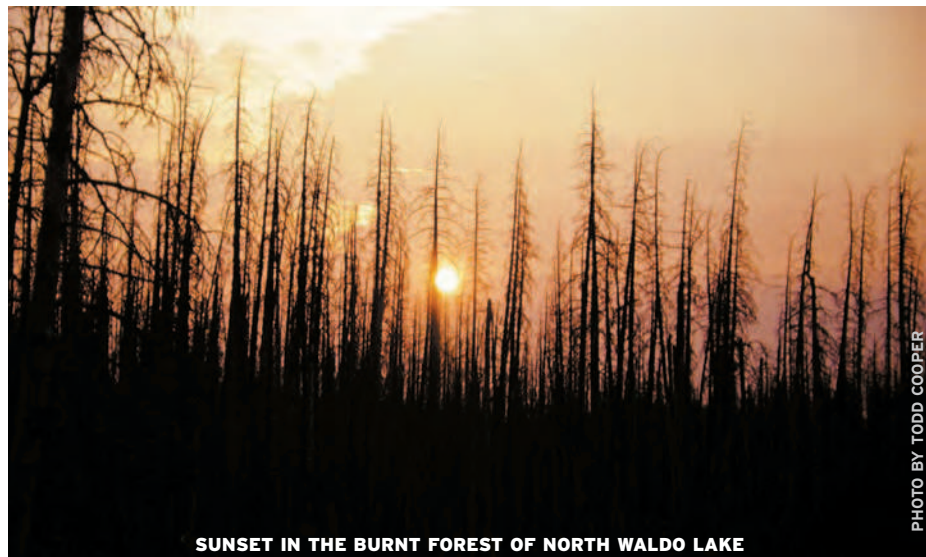
SUNSET IN THE BURNT FOREST OF NORTH WALDO LAKE