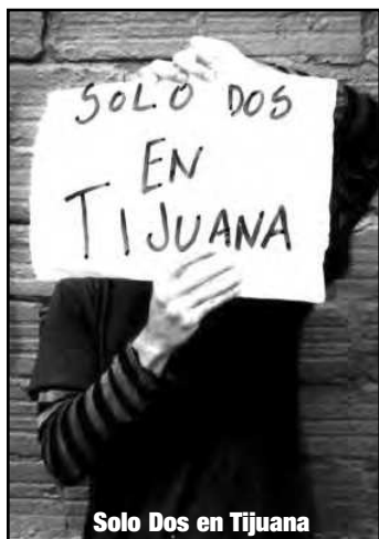
Solo Dos en Tijuana