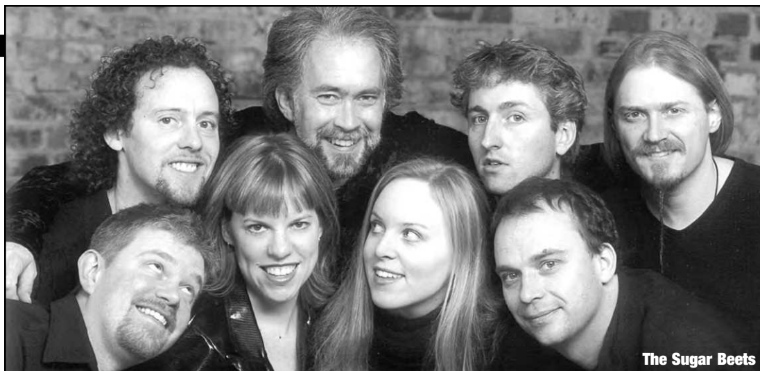
The Sugar Beets