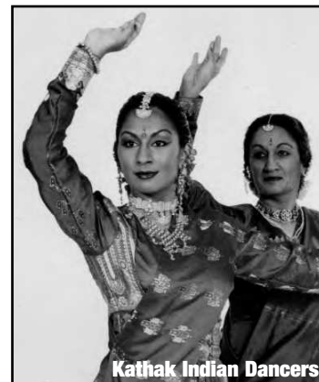
Kathak Indian Dancers