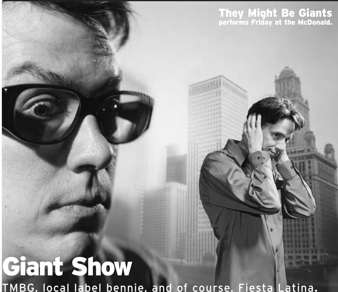
They Might Be Giants performs Friday at the McDonald.