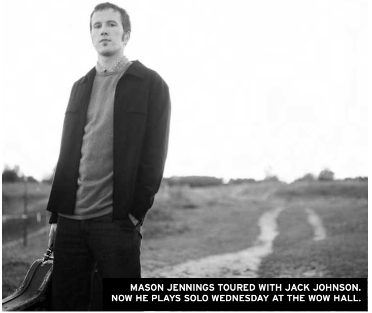
MASON JENNINGS TOURED WITH JACK JOHNSON. NOW HE PLAYS SOLO WEDNESDAY AT THE WOW HALL.