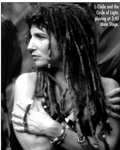
L'Chele and the Circle of Light, playing at 3:45 Main Stage.