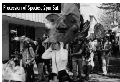
Procession of Species, 2pm Sat.