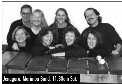
Jenaguru: Marimba Band, 11:30am Sat.