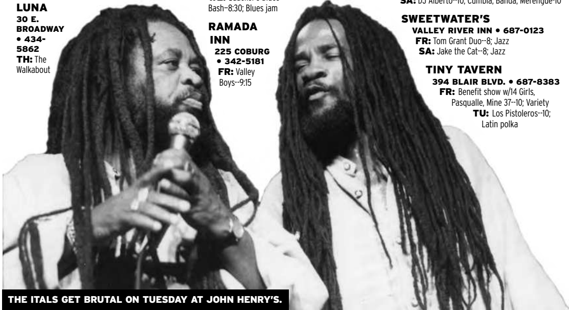
THE ITALS GET BRUTAL ON TUESDAY AT JOHN HENRY'S.