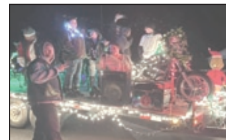
Jacks Barber Shoppe Co Float in the Drain City Christmas Light Parade