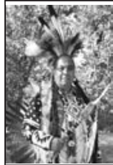
Drain Civic Center 205 West "A" Avenue, Drain OR