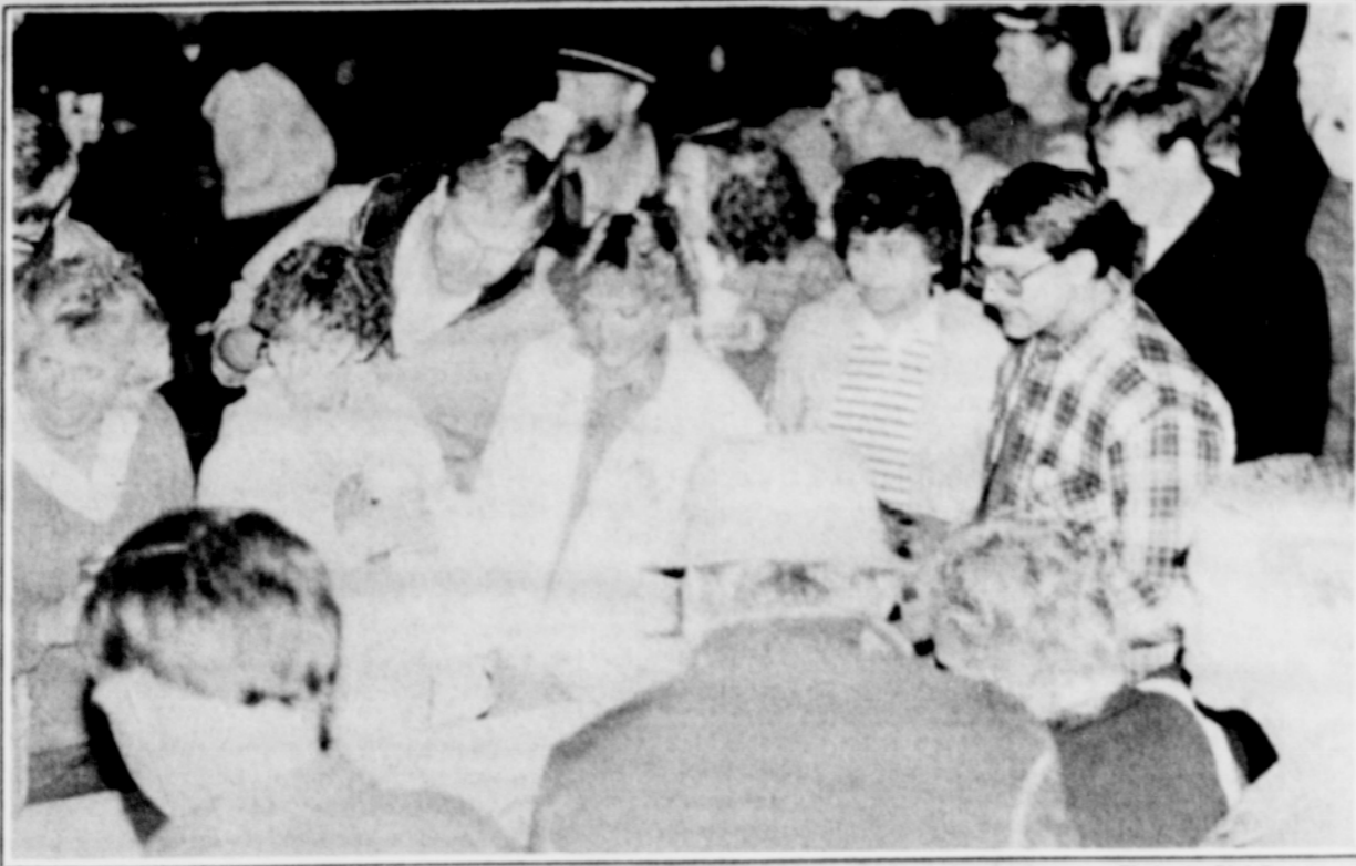
A crowd gathers to watch the slug races.