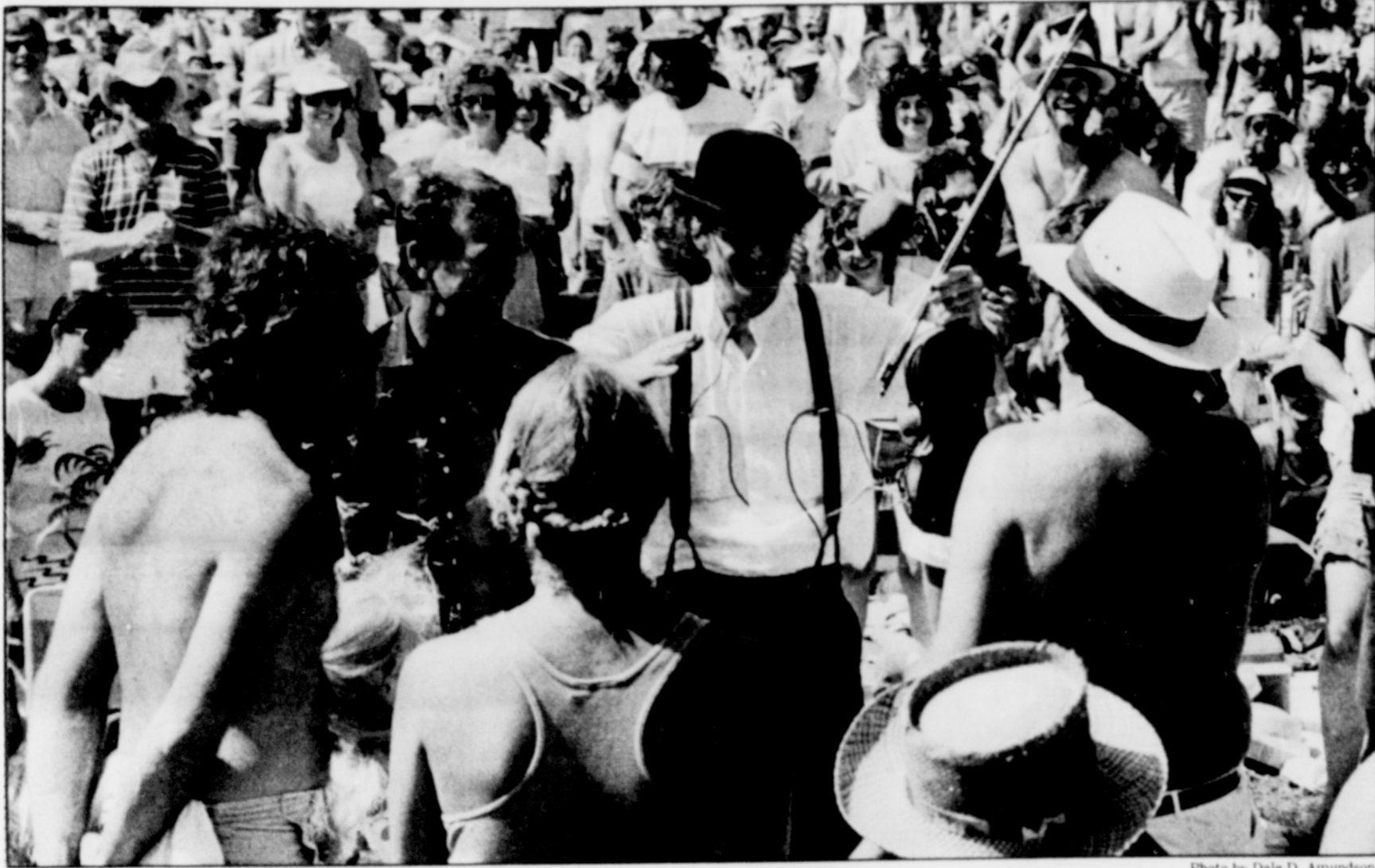
John Hartford moves out into the audience as he entertains the crowd with his bluegrass music at Rippling River on Sunday.