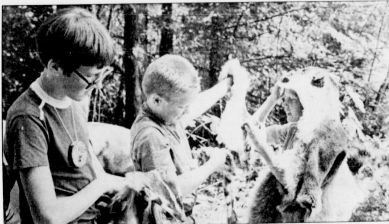
Kelso School students examine the animal furs during an outdoor school program on the Sandy High nature trail.

Students who choose to participate in the program attend a three-hour