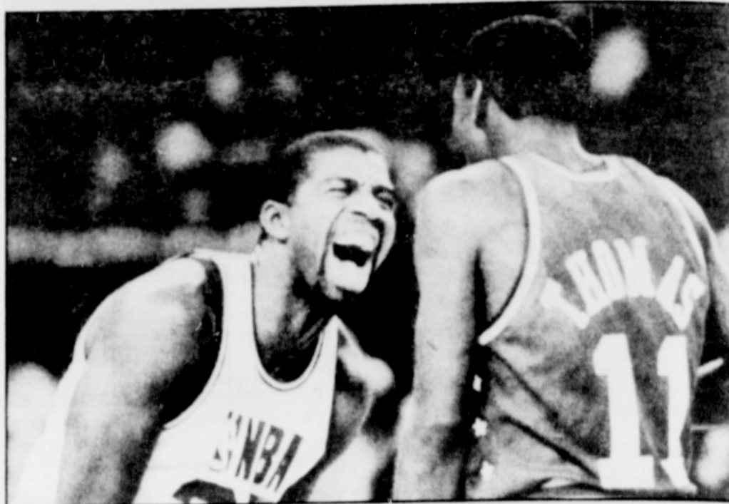
During the NBA All-Star game, fun-loving Magic Johnson (left) laughs with his good friend Isiah Thomas. Thomas plays for the Detroit Pistons.