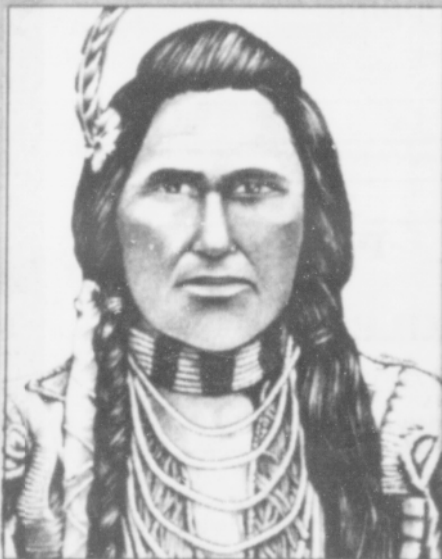
Indian Scare At Pilot Rock Page 11