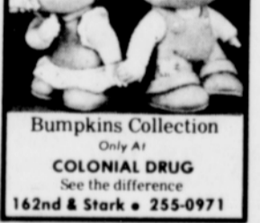
Bumpkins Collection Only At COLONIAL DRUG See the difference 162nd & Stark • 255-0971