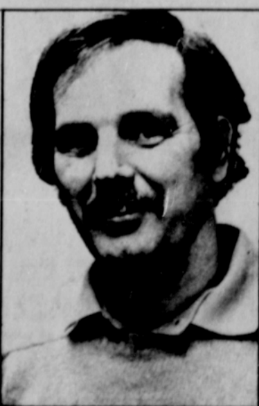
by Hank Emrich

The other problem with turkey is that it is never done at the right time. The turkey is usually just perfectly cooked about one hour after you needed something to rescue you from Uncle Louie's dissertation on why shin cancer is a plague among earthworms. If Uncle Louie isn't going to be there,