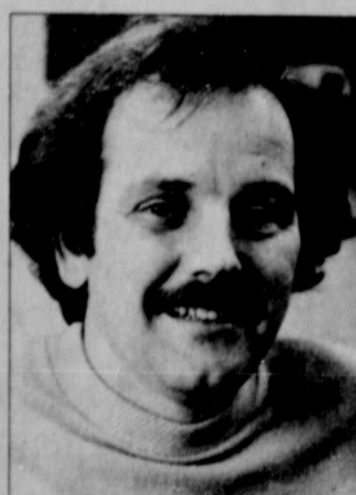
by HANK EMRICH

The problem probably goes back to the introduction of Japanese autos to the American market. Not being of the same stature, the Japanese probably installed the speakers at a comfortable hearing range for themselves. It's the same with