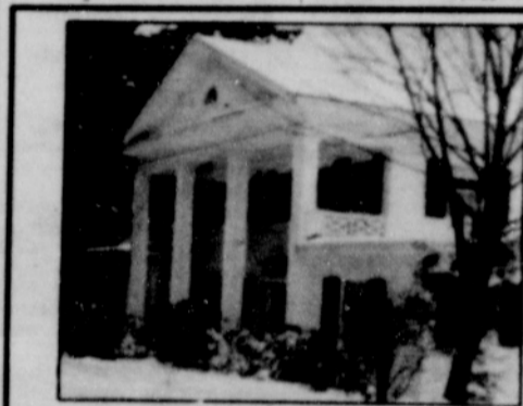
SOUTHERN COLONIAL On Approximately 2 Acres

6500 square feet home in Columbia Gorge. 3 bedroom, 3 1/2 bath plus 2 maid's rooms and bath, 3 fireplaces, large living room, dining room, family room, library, solarium, crystal chandeliers, orchard & dog kennels. Call Owner 695-2360