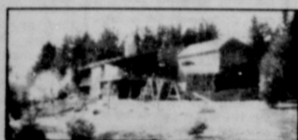
CUSTOM ON ONE ACRE — VIEW

Enjoy Mt. Hood from the living room. 2 level home. $74,950. Family room, 2 fireplaces, 2 1/2 bath, approx. 2300 sq. ft. $20,000 down, monthly payments of $513.15 including principal & interest for 360 mo., plus taxes.