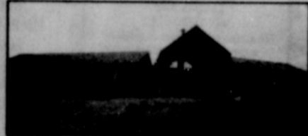
4100 SQ. FT. - CUSTOM - 2.4 ACRES

What your wife is looking for is this 3,600 sq. ft. beauty, ONLY $149,950. Contemporary ranch with daylight basement has at least 4 bdms., 3 baths, formal & family living enjoyment. Located on Mt. Scott, view of the valley, Mt. Hood & lots more.