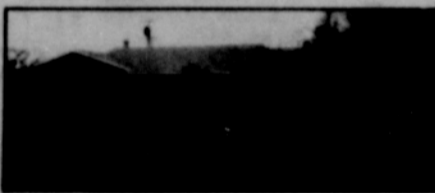
FLAT CHEAP — SELL NOW

Daylite ranch. East Hill area - family home. 2,850 sq. ft. approx. Magnificent condition, 2 fireplaces, 3 baths, family room & separate game room, double garage plus shop area. Beautiful lot.