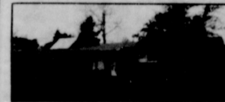
CLIFGATE — $65,950

Immac., 3 bdrm., 1 1/2 bath, dbl. garage, woodstove. Bright & cheery, fenced yard, solar heat. Reno and more. 9-1/8 annual percentage rate. Call John or Jim, 255-4904, eves. 255-8222.