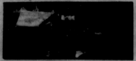
LOG HOUSE SANDY RIVER FRONTAGE

David Douglas, newer 3 bdrm. ranch. Double garage, fireplace, energy efficient, 6" exterior walls (well insulated), double windows. Only $48,950.