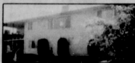
5 BEDROOMS — $89,950

Pure Quality Craftsmanship. This home & setting aren't replaceable. Approx. 2.4 — 3 plus bedrooms, 1 1/2 baths, arched log walkway over living room, floor to ceiling rock fireplace, natural wood thruout, det. garage, private grounds w/ mature fir trees. All this for only $178,000.