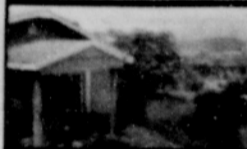
Million Dollar View