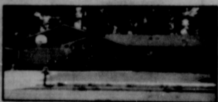
CLEAN & CRISP

Only $129,950. Contract terms. View. 3 bdms., room for 6, living room features hanging fireplace, cathedral ceilings, wood accents. Perfect home for large family. Double garage plus extra large shop.