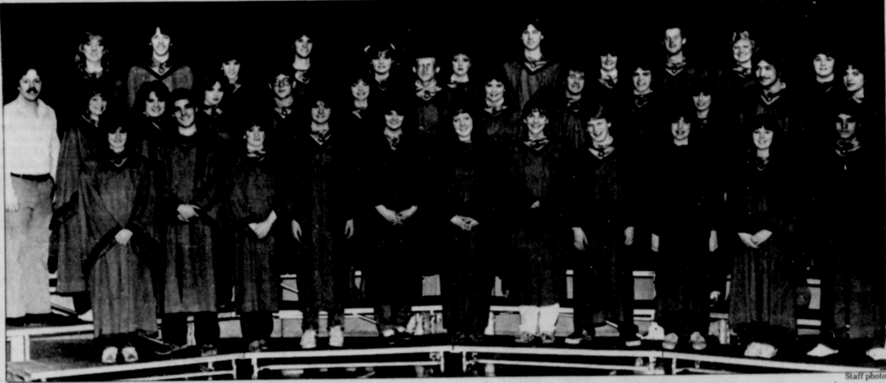
The Sandy High School symphonic choir and other vocal music groups will perform at the annual Spring Vocal Concert April 26. It will be held in the SUHS commons at 7:30 p.m. No admission will be charged.