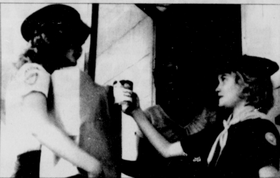
Pathfinders in Sandy and Boring are busy this week collecting food to help stock Thanksgiving baskets for deserving families.

Pathfinder Clubs are sponsored by the Seventh-day Adventist Church.