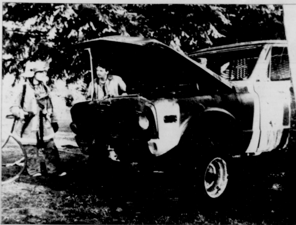
A spark from a grinder is the suspected cause of a sudden fire last Thursday that gutted a 1970 Chevrolet half-ton flatbed truck owner Tony Sager of Troutdale was restoring with family help at 46000 Snow Lane east of Sandy. The truck was valued at approximately $2,000.