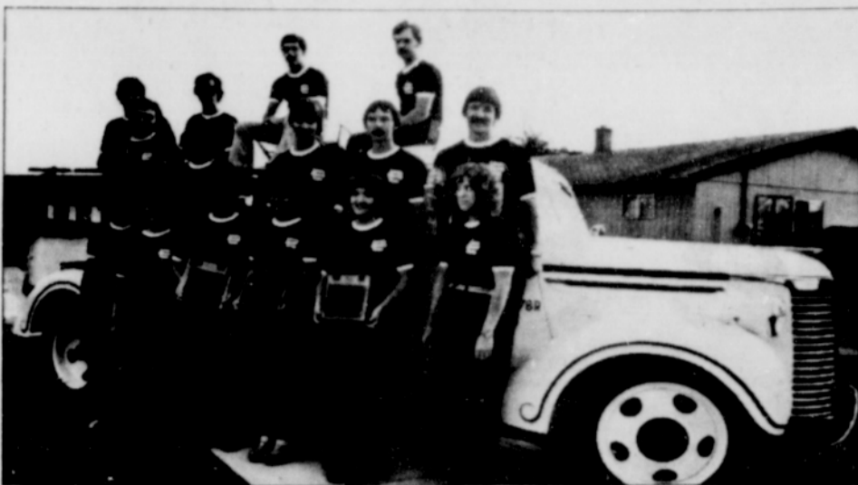
The Sandy muster teams, both men and women's, recently captured two first places and a second place at the Prineville muster.

Damage to the lodge is reported to be minimal.