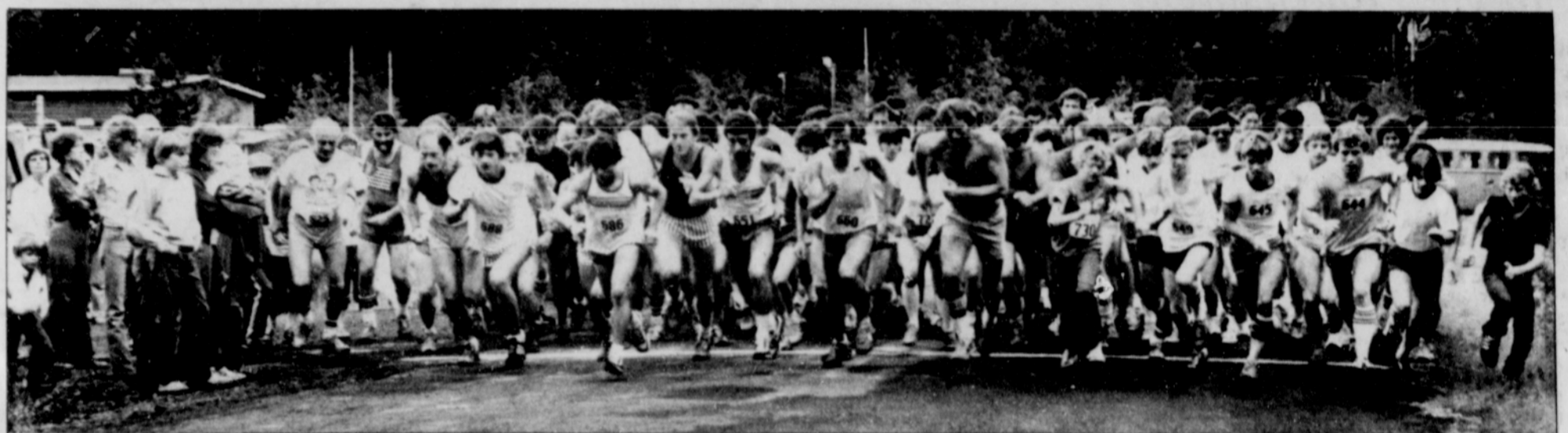
About 114 runners competed in the Hoodland Volunteer Firefighters Association's July Fly on the Fourth.