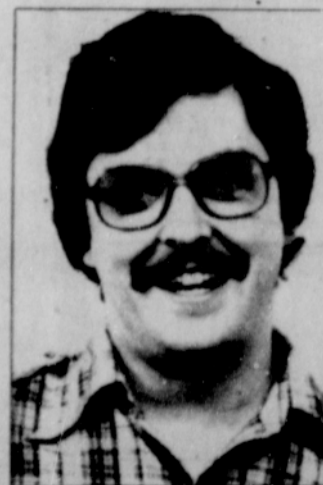
by DAN DILLON

senators and representatives evidently have days full of stress. Sparing the populace the added cost of throwing elections to replace dying legislators, the daily report of legislative activities provided its readers with some hints for unwinding.