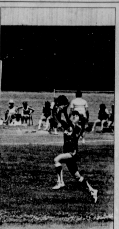
Making the play