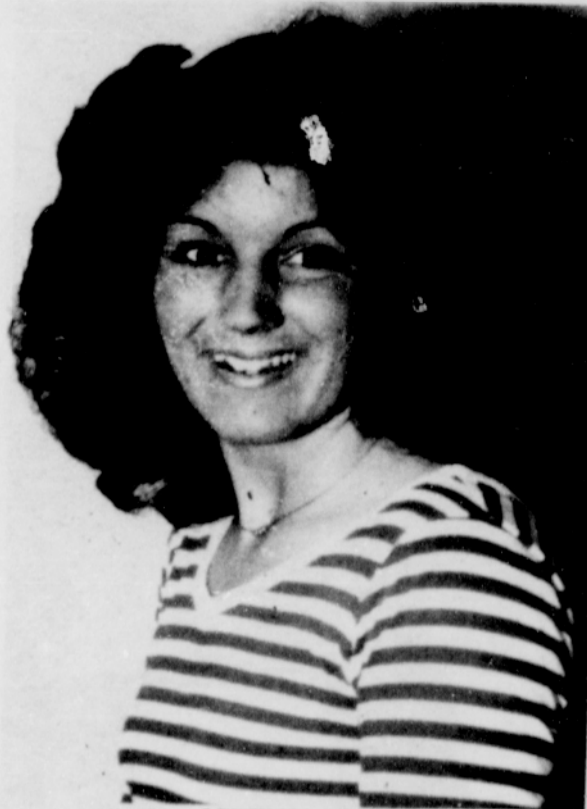
CONTESTANT # 13