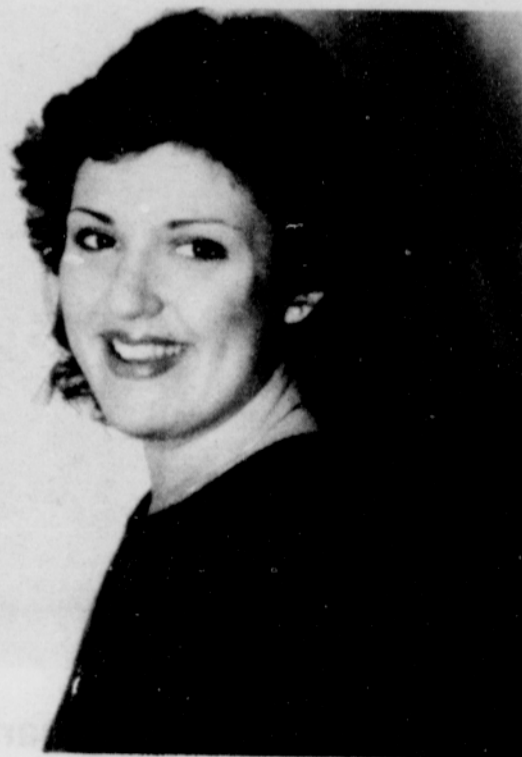
CONTESTANT # 10