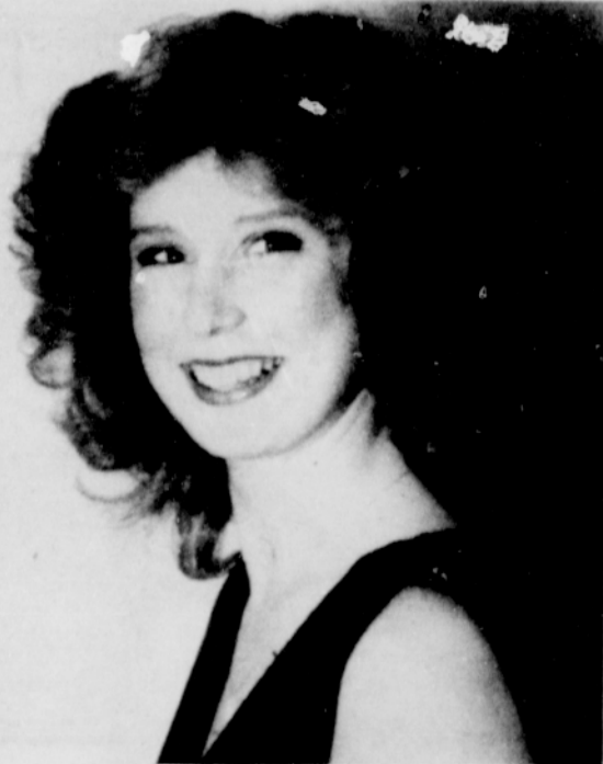
Contestant # 5