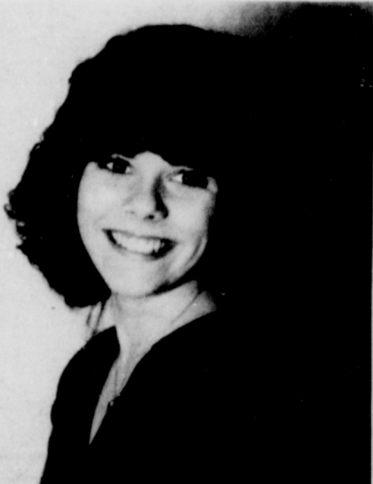
Contestant # 3