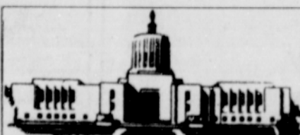
Legislative Report from the State Capital EXCLUSIVE to Oregon's Weekly Newspapers from Associated Oregon Industries.

In fact, mere consideration of such legislation by the Oregon Assembly could actually deter improvement of the state's job climate if not actually worsen the situation that's evolved during the last decade.