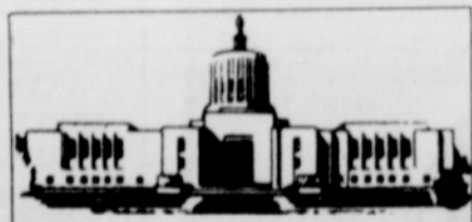
Legislative Report from the State Capital EXCLUSIVE to Oregon's Weekly Newspapers from Associated Oregon Industries.

"The scholarship investment turns over many, many times for the high school