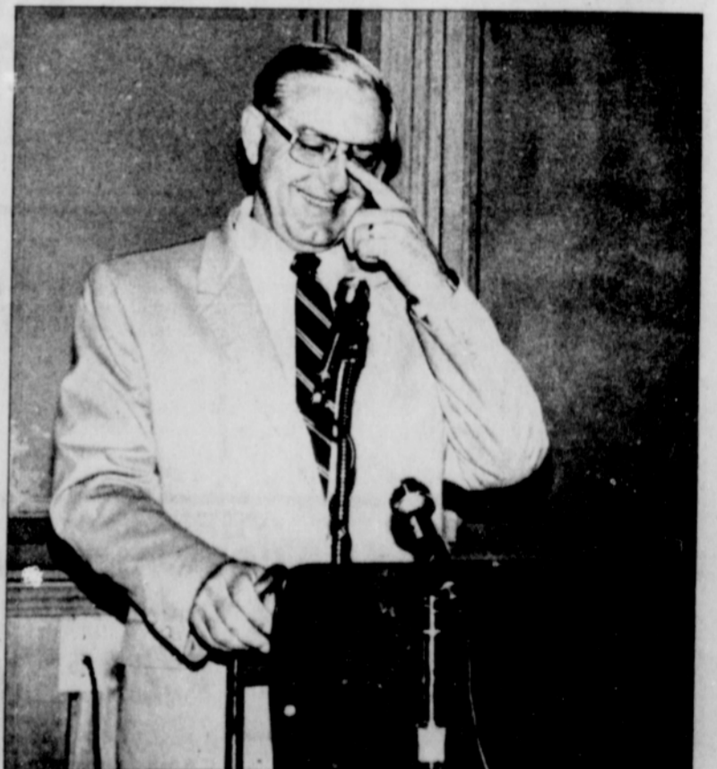
Gov. Vic Atiyeh smiles as he looks at a bundle of sticks presented him Tuesday by an angry property owner fed up with the state planning procedure.

On correction facilities: "It's a sheer recognition that in order to deal with criminals, we need someplace to put them," he said. "I'd like to see the state involved in preventing crime from occurring in the first instance, which means a change of attitudes." The governor also expressed interest in a