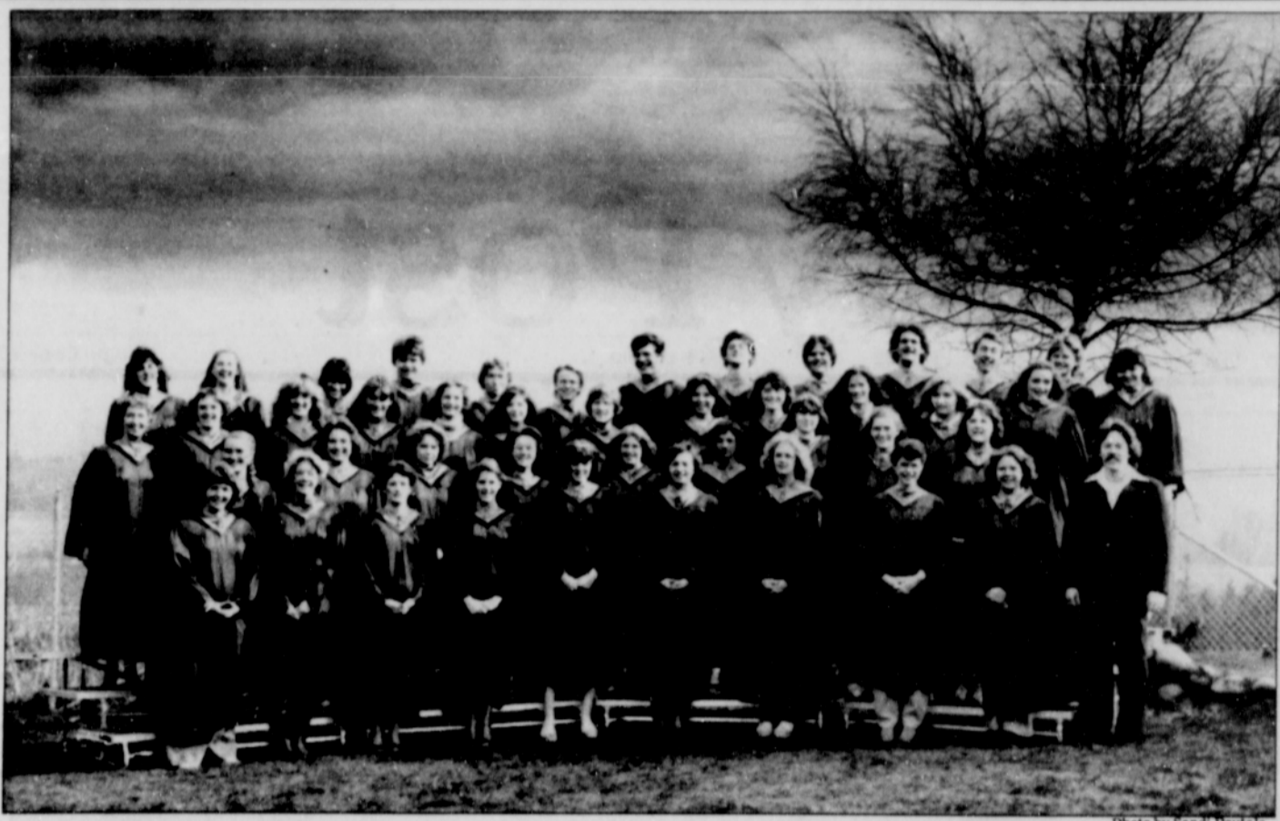
The Sandy High School Symphonic Choir will travel to Vancouver, B.C., at the end of this month to compete in the "Discover British Columbia Music Festival" after a year of fund-raising activities.