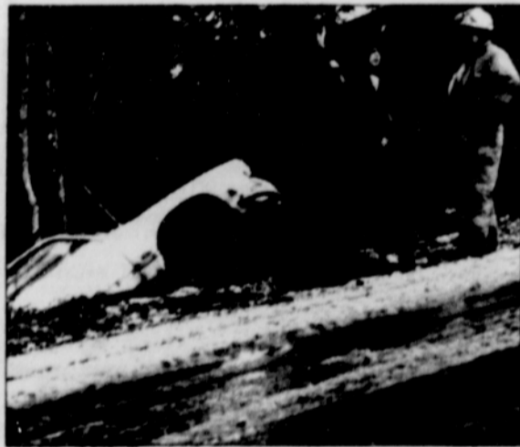
An early model Karmann Ghia driven by Mitche Butts of Sandy slid off the road down an embankment in a sudden hailstorm last Wednesday afternoon at the west end of Orient Drive. A tree braced the car's fall from a stream below. There were no injuries.

2 1/2 Miles East of Gresham on SE ORIENT DRIVE 663-4411