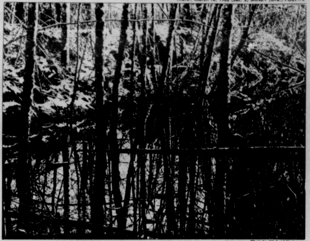
This wetland area near Brightwood is close to where the Alderwood mobile home subdivision is planned.

Spring term begins March 29. Register now.