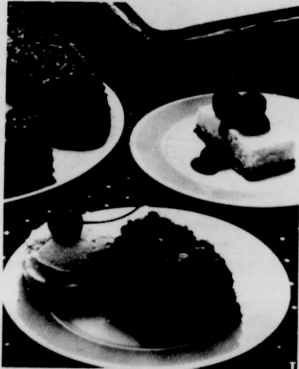
Double Winners! These two desserts are an impressive ending to special dinners yet are quick and easy to prepare.