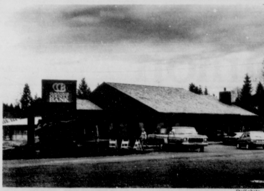
The remodeled Hoodland branch of Clackamas County Bank will be featured in an open house next Thursday.

You need not be a resident of Sandy to use the Sandy Public Library. Any resident of Clackamas County is eligible. Library hours are 2 to 9 p.m. on Tuesday, Wednesday and Thursday, and 10 a.m. to 6 p.m. on Friday and Saturday.