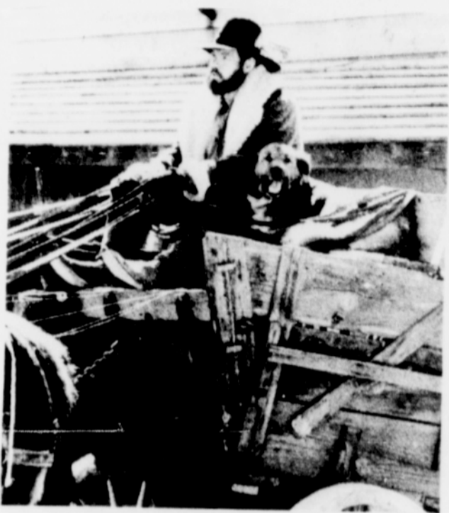
Merlin Olsen stars in a new series as a rugged 1870s gold miner who pretends to be a Catholic priest in "Father Murphy," to air Tuesday, Nov. 3 on NBC.

(Stations reserve the right to make last-minute changes.)