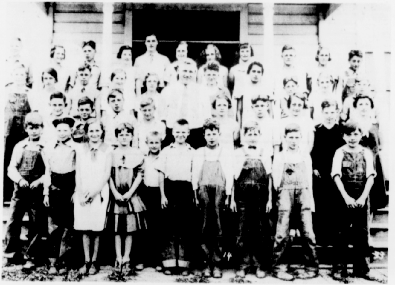
This picture of the 6th, 7th and 8th grades was taken in September 1933 on the front steps of the old Boring Grade School on Richey Road.

Wednesday, Aug. 26 The Sandy TOPS Club meets at 9 a.m. in the Sandy Community Action Center.